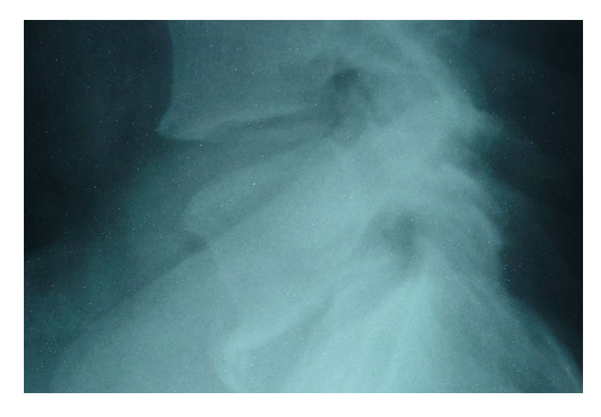
Figure 4: Note the lateral lumbosacral view shows the degenerative L5-S1 disc disease. This xray is taken 3 months after surgery.

Certainly questions arise over how the patient is responding to care. I presented this case at the October 2006 interdisciplinary clinic held at Lutheran Hospital in Fort Wayne for Part III certified doctors of chiropractic. The surgeon who operated on this patient was a presenting lecturer also.