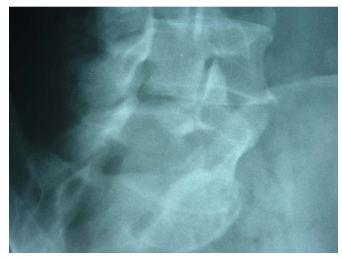
Figure 2 shows that to remove this huge free fragment, the inferior left L5 facet joint was removed (see the oblique view Figure 2). This xray was taken at my clinic three months after the surgery.